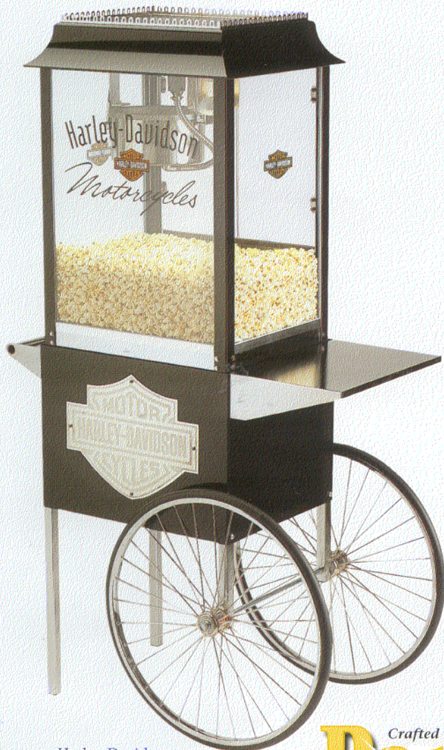
Harley-Davidson 8-oz popper with cart