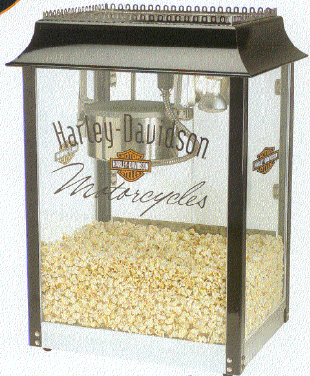
Harley-Davidson 8-oz popper

Plenty of chrome, stainless steel and Harley-Davidson logos emblaze this 8 ounce popcorn machine. The etched stainless steel "Bar & Shield" and the traditional orange, black and chrome scheme make it ideal for the gameroom, office or bar of the Harley-Davidson enthusiast.